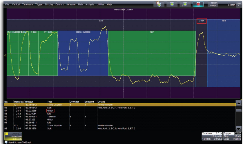
Identify the USB signal type, timestamp, Device address and Endpoint using the Table display. Quickly identify items of interest, such as a glitch following an End of Packet (EOP).

The powerful search engine of the USB 1.x/2.0 decode package can quickly find an Event, Packet, Transaction, or Protocol Error. Search through a long record of decoded data by entering any of the 45 available search criteria by entering a value or simply finding the next occurrence.